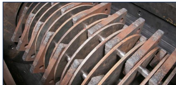
WA Series rotor assembly featuring optional tungsten carbide coated hammers for highly abrasive applications.