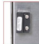
Closed door safety sensor prevents operation when front door is open