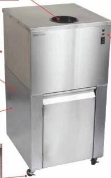
Easy operation - simply turn it on and push a bottle down the feed chute. Green indicator light illuminates when unit is running. Red indicator light illuminates when a fault has occurred.