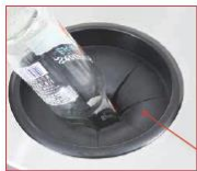
Multi-level baffle system on feed chute for safe operation and glass containment