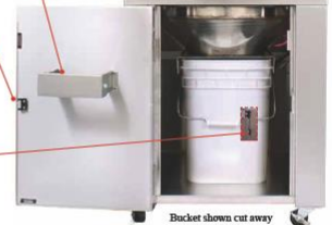
Bucket shown cut away for illustrative purposes